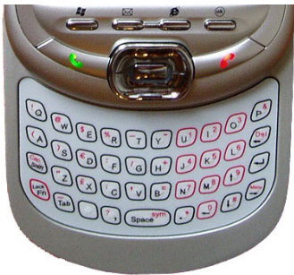
Figure 1: An XDA II's thumb-based keyboard

Fifty participants were recruited to type the series of the text messages, using an XDA II handset that deploys a representative example of today’s thumb-based keyboard, as illustrated in Figure 1. In order to capture the keystroke data, appropriate software was implemented using Microsoft’s Visual Basic .NET, and deployed on the handset. A screenshot of the software is provided in Figure 2. As usual in keystroke analysis studies, corrections were not permitted in case the user misspelled a word as this would undesirably interfere with the data of the inter-key latency (Umpress & Williams, 1985). Instead the whole word should be retyped in the correct form. The data collection was performed in a single session, although it would be preferred to collect the data during multiple sessions, as thus a more indicative typing profile of the users could be captured.