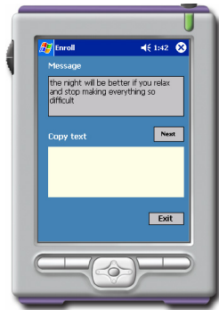
Figure 2: Screenshot from experiment software