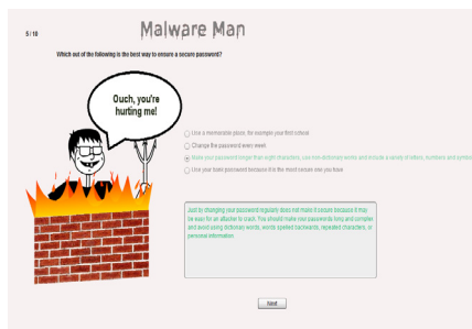
Figure 1: Game Image (Malware Man image sourced from LakeSuperiorComplex (2011).

If the user answers incorrectly then the firewall stays the same size, and the wrong answer and hint text are coloured red. The right answer is coloured green, so that the user can immediately see where they went wrong.