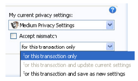
Figure 2: "On the fly" privacy management

The bottom right part of the dialog (Figure 2) displays UI-controls allowing users to change their privacy settings semi-automatically "on the fly". With this is a novel approach users can define their privacy preferences at the moment a transaction takes place by selecting a predefined standard level of privacy ("Nearly anonymous", "Minimum data" and "Requested data") and having the possibility of overruling their settings for the current transaction only, to update their settings for all future transactions or to adapt their settings for future transactions and save them under a new name.