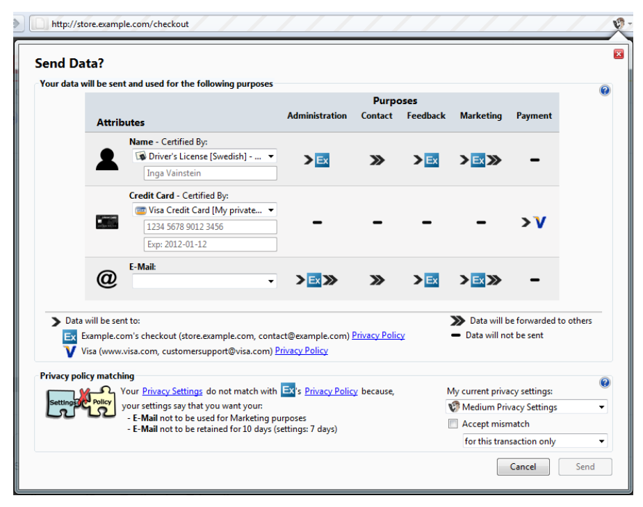
Figure 3: A redesign suggestion for the seventh iteration cycle

This section presents the evaluation results and suggestions for improvement based on the feedback obtained from participants and other spotted usability problems. The improvements have been implemented for the interface of the next iteration cycle, shown in Figure 3